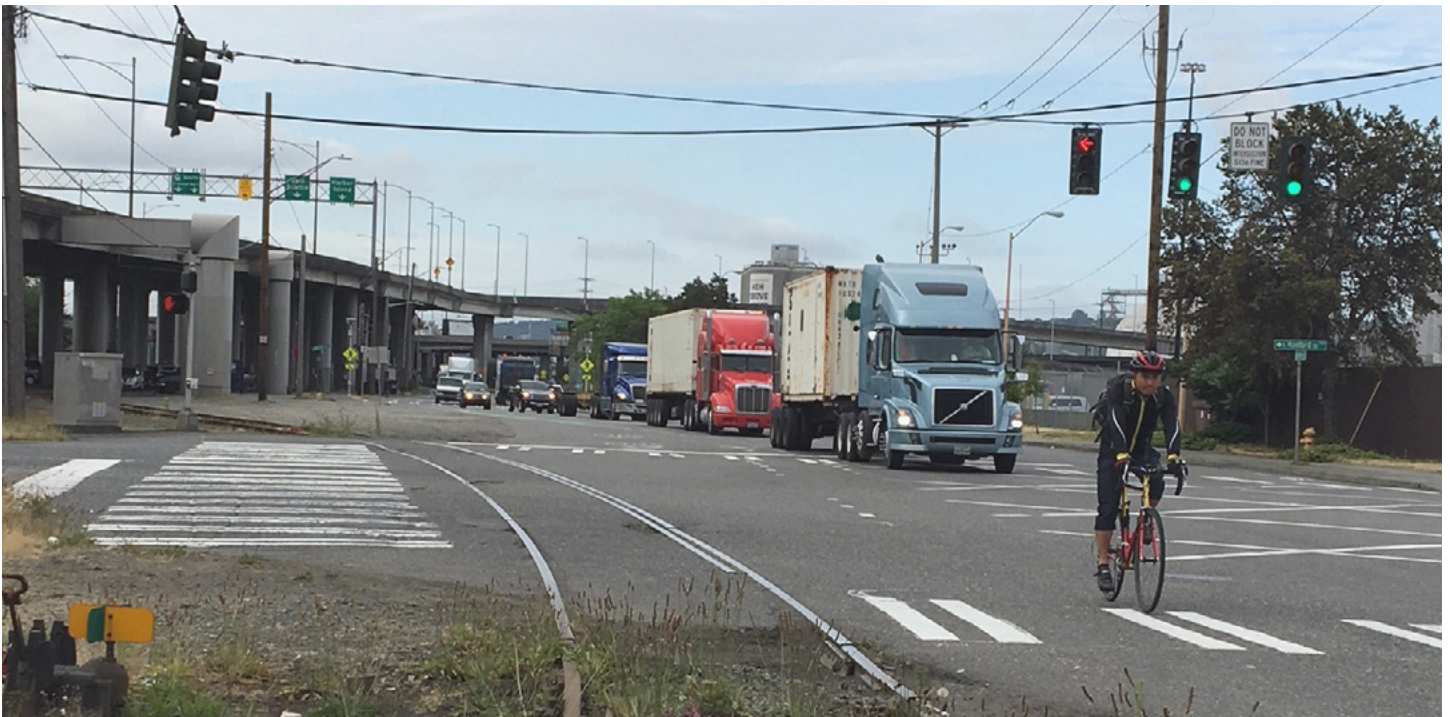
Person riding a bicycle north alongside freight truck traffic at the intersection of East Marginal Way S and S Hanford St.

This project is funded by the 9-year Levy to Move Seattle, approved by voters in 2015, as well as several local, state, and federal funding partners. For more details on project funding, visit our website.